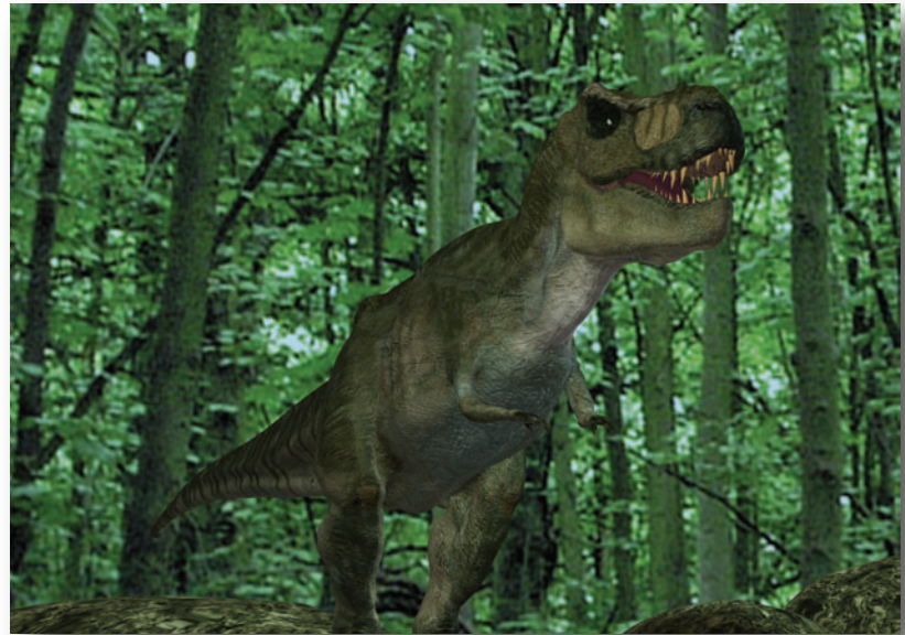
Tyrannosaurus rex as it would have looked in life