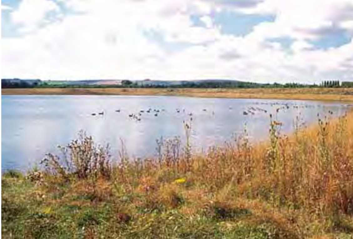
Restored Baulking Quarry, Oxfordshire.

are several million tonnes. These resources are considerably more extensive than the Lower Cretaceous deposits in the Lower Greensand but are only workable by underground methods. Mining ceased in 1979 for economic reasons and because of the low quality of the fuller's earth, which contains a high proportion of calcite with smectite contents of only some 60%. Fuller's earth production was mainly confined to deposits in the Lower Cretaceous Lower Greensand which have accounted for most of cumulative output.