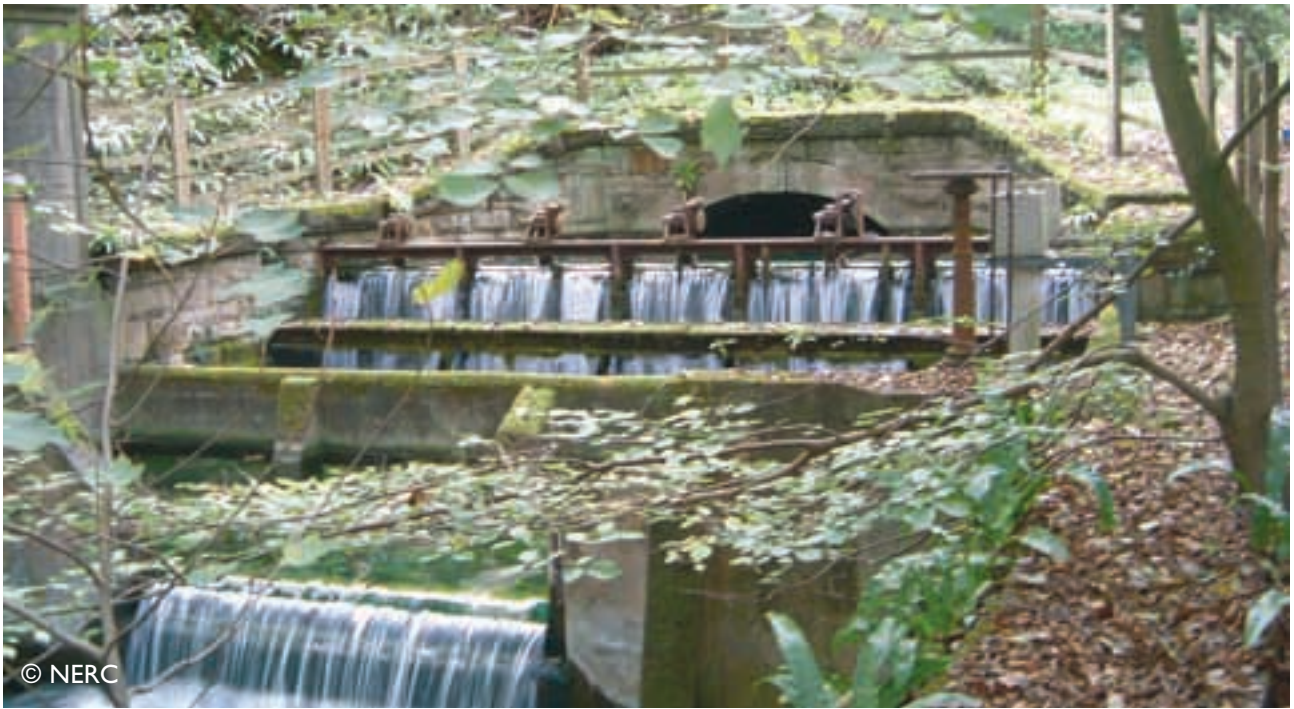
Meerbrook Sough (formerly used to drain lead mines), Whatstandwell.