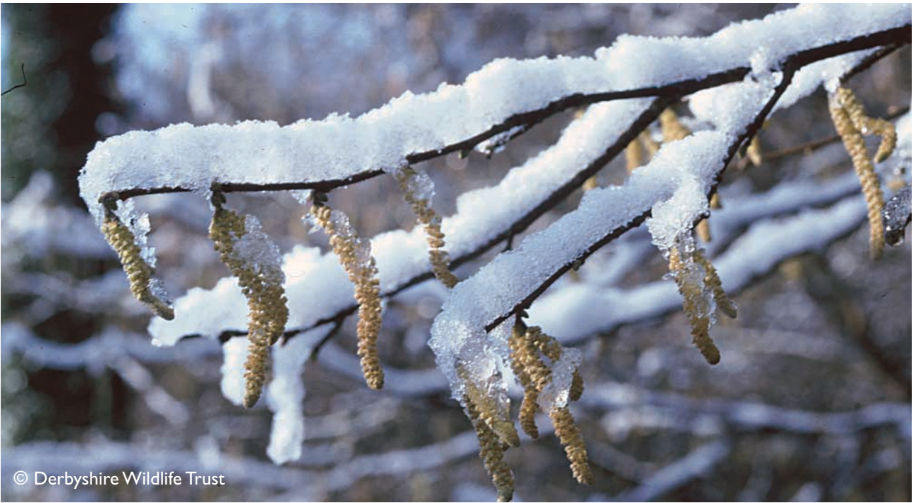
Snow on catkins.