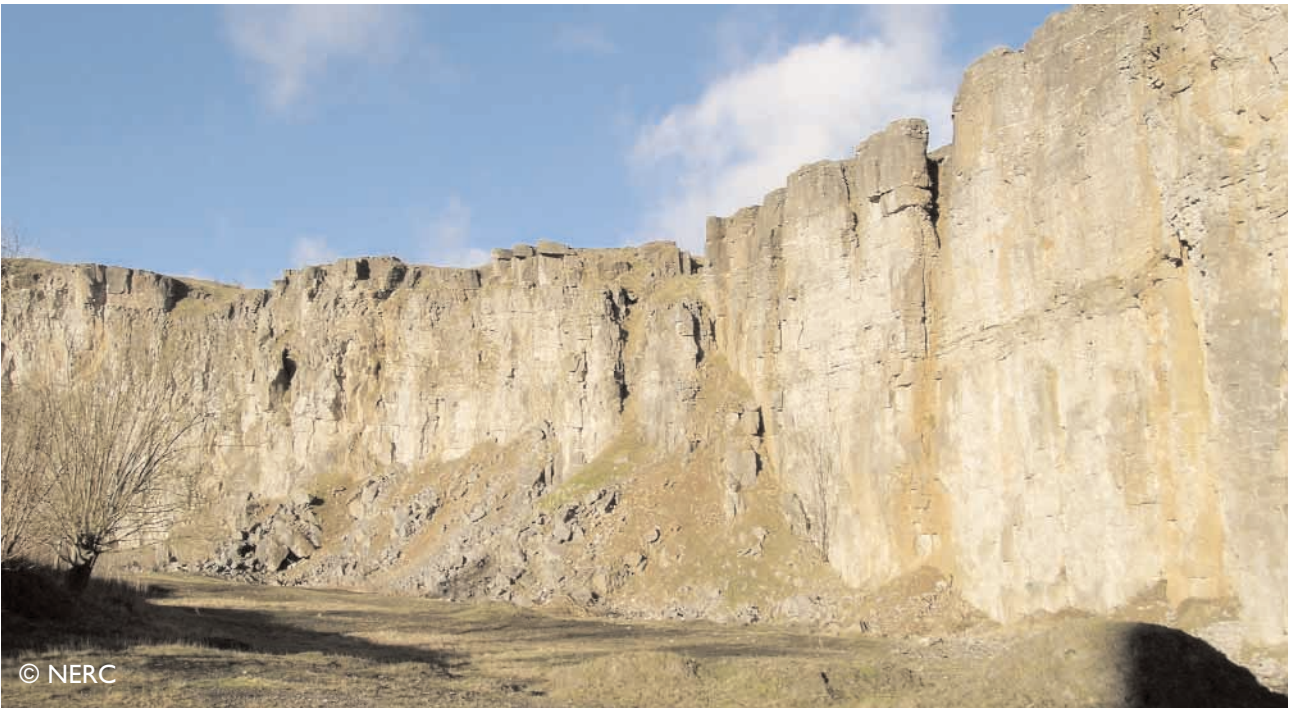
Intake Quarry, Wirksworth.