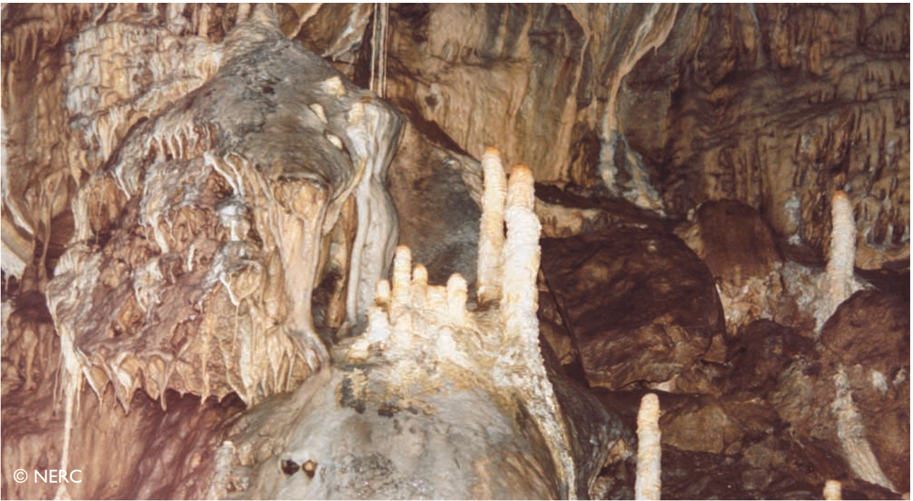
Stalagmites in Pool's Cavern, Buxton.