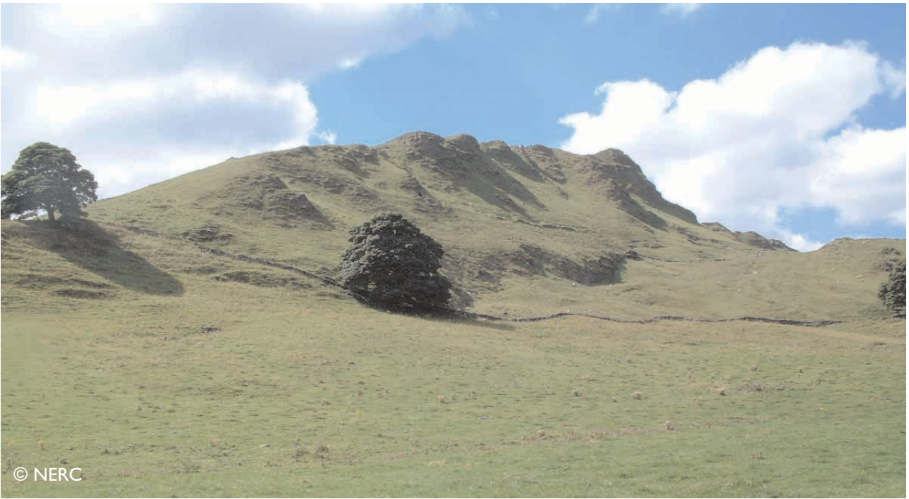
Chrome Hill near Earl Sterndale.