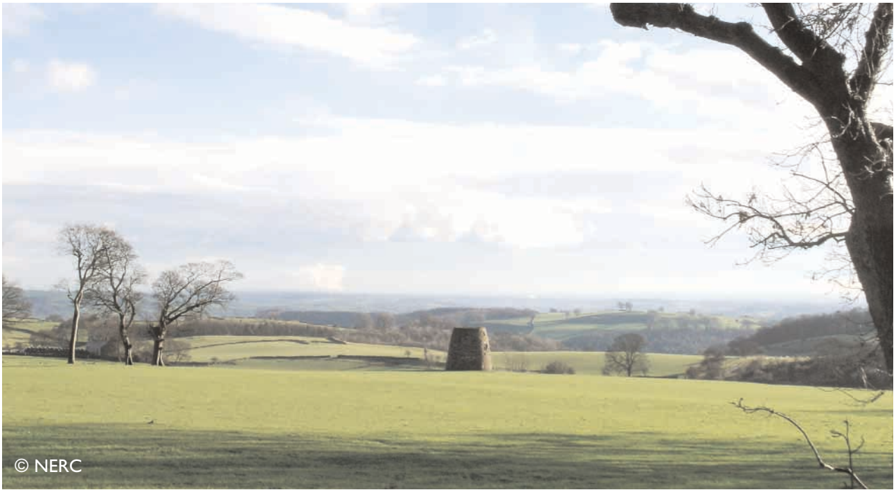
Looking south east from the High Peak Trail near Hopton.