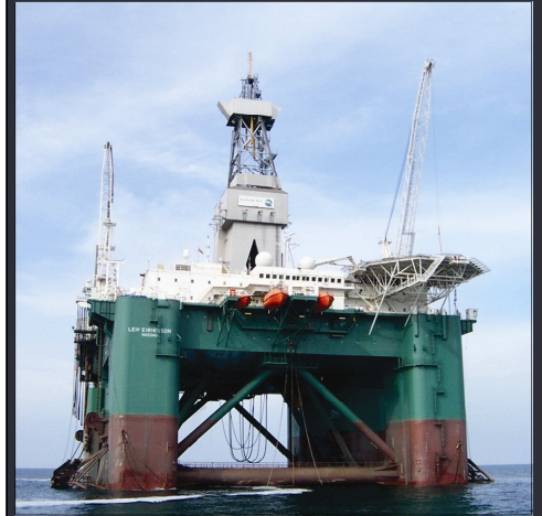
Leiv Eiriksson.

The Ocean Rig 5 th generation semi submersible Leiv Eiriksson has now completed its work for Cairn Energy in Greenland.