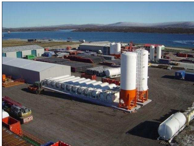
The yard with its first equipment.

With the mobilisation of the Leiv Eiriksson the Borders & Southern programme has now begun to gather momentum. The lay down areas are nearing completion and have already had the first delivery of equipment, with another expected in mid December.