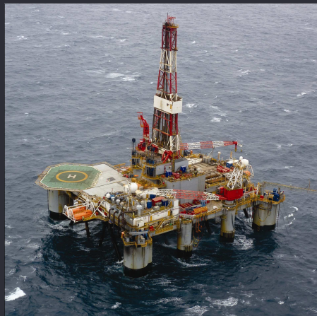
The Ocean Guardian drilling in the Falkland Islands.

Desire Petroleum as contractors for the Ocean Guardian have confirmed that the current well being drilled by Rockhopper Exploration will be the final well for the rig in the Falkland Islands.