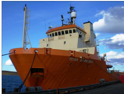
The Toisa Invincible PSV.

The next well 14/10-8, was both to appraise the SLMC and explore for the "Casper" and "Kermit" fans. The well was drilled to a total depth of 2635m and encountered good quality, thick reservoir packages in all three targets. However all the sands were water wet and the well is a dry hole. Rockhopper believe that the reservoir in this well is separated by a fault from the rest of the SLMC, hence the lack of hydrocarbons. However the prognosis for the rest of the field has been upgraded because of the thickness and quality of the reservoir encountered.