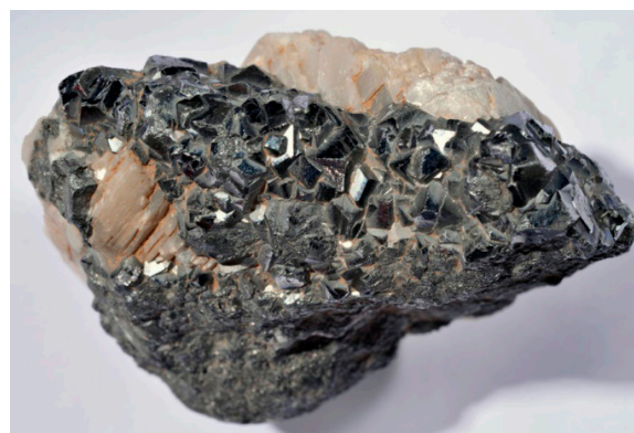
Figure 1 Skutterudite, a Cobalt-Nickel Arsenid. P725507.

Nickel is found in several parts of the UK but the most interesting occurrences are in north-east Scotland.