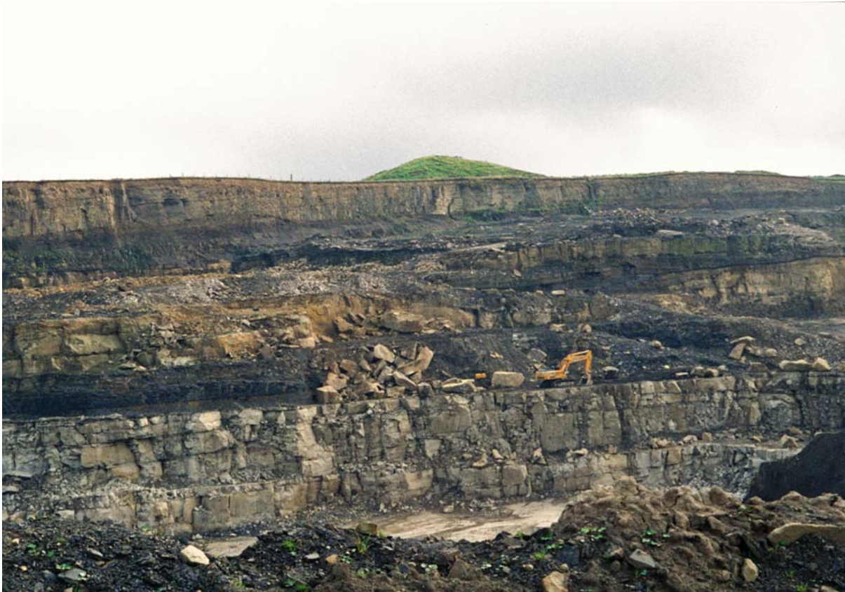
Figure 3. Fletcher Bank Quarry, Bury, Marshalls Natural Stone, producing concreting aggregates, crushed rock aggregate and walling stone.

The crushed rock aggregate resources of Greater Manchester are confined to Carboniferous sandstones which, whilst relative extensive, do not provide a source of high quality aggregate.