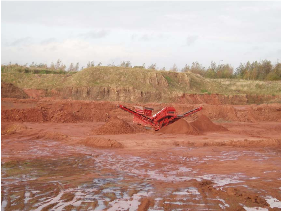
Figure 2. Morleys Hall Quarry, Wigan, Sandtime Ltd, working Triassic, Sherwood Sandstone.

Additional resources of sand and gravel may be won from exploiting suitable bedrock deposits. Triassic sandstones of the Sherwood Sandstone Group are being worked at Morleys Hall Quarry southeast of Leigh to produce sand for mortar and asphalt. The Sherwood Sandstone has been deeply weathered in places by a tropical climate during pre-glacial times. The upper part of the sandstone, immediately below the drift cover, is sometimes weathered to the extent that the cementing material between the sand grains has disintegrated leaving the original quartz grains in the form of sand that can be worked without substantial crushing. The weathered portions of the Sherwood Sandstone usually do not have an ideal particle size distribution for use in mortar, concrete or asphalt and usually the sand is too fine grained or too weak for use as concrete aggregate. Difficulties in removing overburden in the form of glacial till and extra treatment in crushing, however minor, together with washing and slime removal can often make the resource uneconomic compared to more easily worked glacial sands. The Sherwood Sandstone is, therefore, rarely worked and is not shown on the map