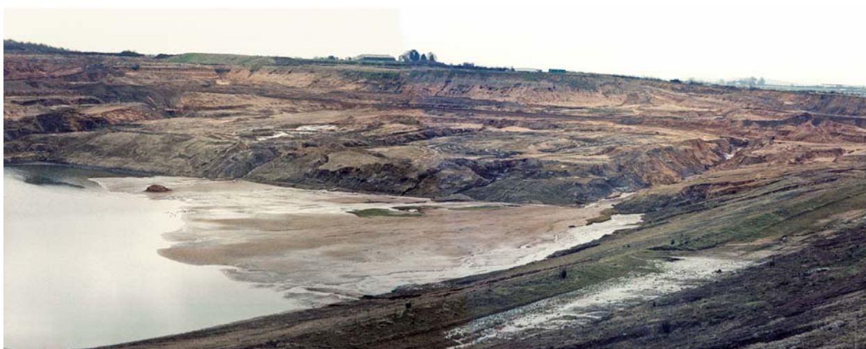
Figure 1. Pilsworth Quarry, Bury, Tarmac Ltd – North West, working glaciofluvial sands.

The high terraces of the Mersey Basin were most probably formed at the end of the last Ice Age when the mouth of the river was still blocked by ice in the Irish Sea; thus water was ponded up in the lower Mersey valley and escaped over the neck of the Wirral peninsula. The spillway over the Wirral controlled the base level and it is to this that the high terrace is graded to. The sudden fall in the base level of the rivers took place when the last glacial ice melted and the present Mersey channel became open. The high terrace is currently being worked along with more recent river terraces of the River Goyt in Offerton Quarry near Stockport.