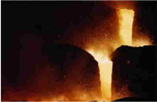
Molten metal being prepared for casting

The Spanish company Celsa ( Compañía Española de Laminación) , which bought the former Allied Steel and Wire (ASW) Cardiff steelworks in 2003, has announced that production will start in the spring of 2006 from a new electric melting and casting facility being built on the former ASW nail mill. The new facility's capacity is planned to exceed 1.2 million tonnes per year of cast billet produced from 100% recycled steel scrap.